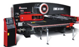
Manufactured using CNC Machines